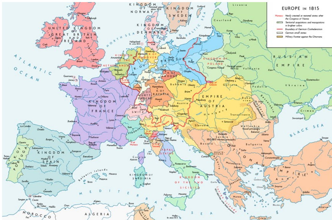
Click here for full scale map site